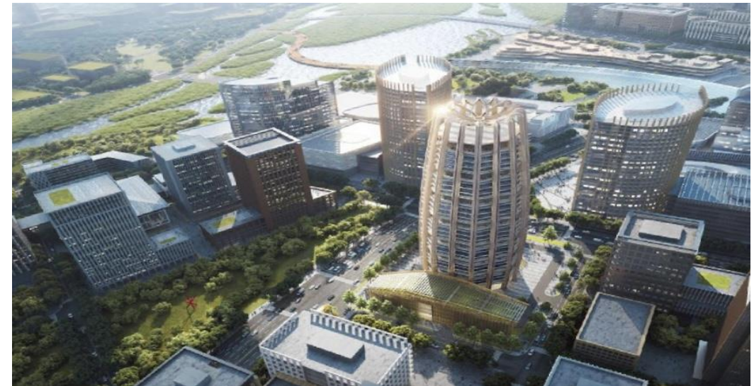
雄安中国中化总部大楼 Headquarters of Sinochem Holdings Corporation Ltd. in Xiongan