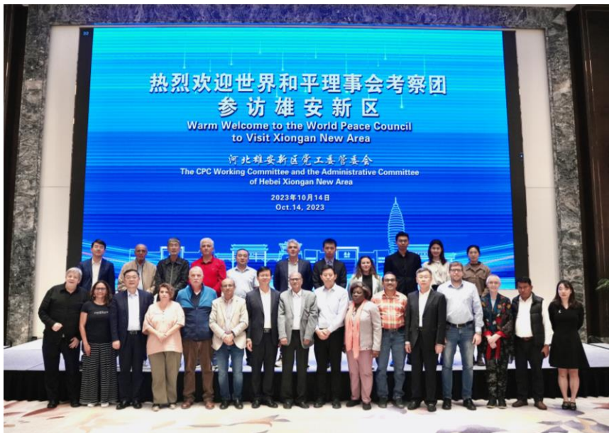
2023. 10. 14 世界和平理事会主席率团参访雄安 President of the WPC led a delegation to visit Xiongan