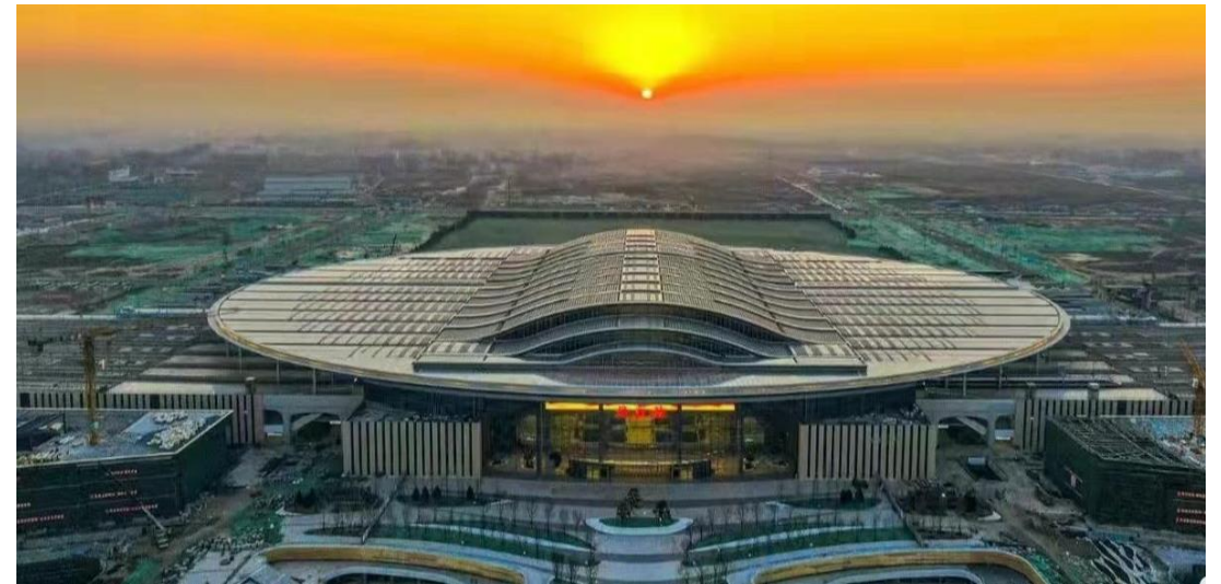
京雄高铁雄安站 Xiongan Railway Station