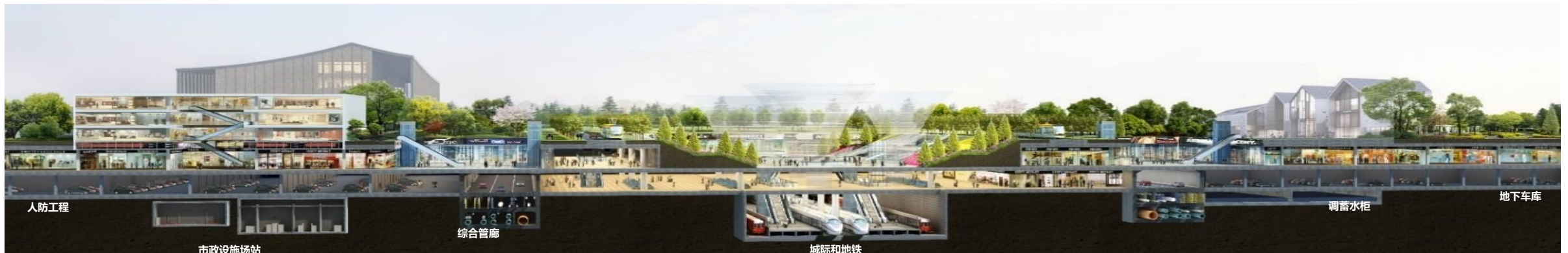
雄安地下空间布局示意图 Layout diagram of Xiongan underground space