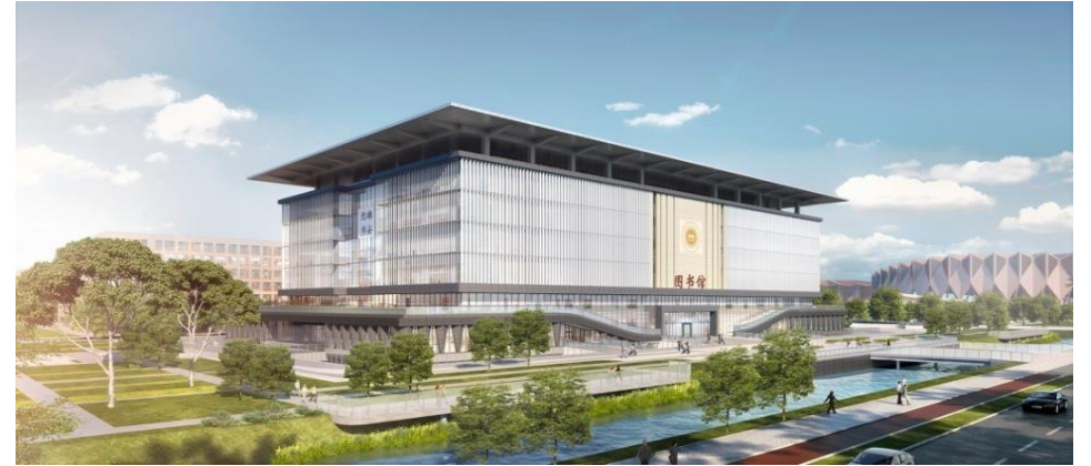
雄安图书馆 Xiongan Library

Following the principles of “integrating production and urban living, achieving work-life balance, creating an ecologically livable environment, and ensuring convenient transportation,” we have established three levels of living circles in communities, neighbourhoods, and blocks, with walking distances of 15 minutes, 10 minutes, and 5 minutes respectively. In this city, the buildings are not too tall, there are numerous parks, the environment is beautiful, and traffic is not congested. You can walk to work, walk to school, and find soccer fields at every corner. You can turn on the tap and drink directly from it, and your car can be parked under the shade of trees. This is a child-friendly city equipped with top-tier education, healthcare, and elderly care services. The people are nice, the city is clean, and entrepreneurship is made easy. It’s an effort to create a miraculous and desirable city where people’s hearts and aspirations can truly find their home.