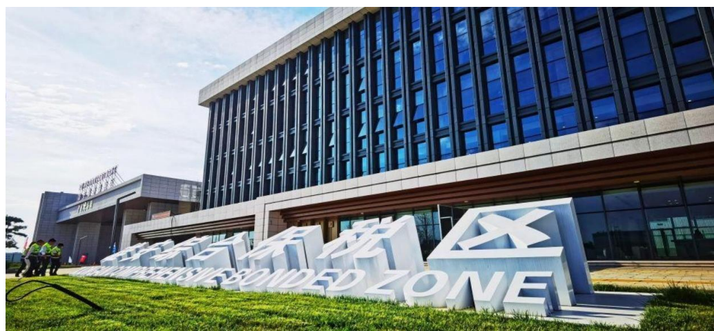
雄安综合保税区 Xiongan Comprehensive Bonded Zone