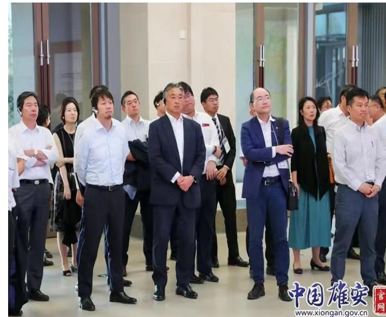
2023. 07. 18 日中投资促进机构参访雄安 Japan China Investment Promotion Organization visited Xiongan

雄安是中国的，更是世界的。 习近平主席强调，要广泛吸引、聚集国内外的力量和资本共同参与雄安的建设和发展。瑞士在生物制药、高端制造、金融投资、文化旅游、绿色经济、创新产业发展等诸多领域具有很强优势，我们热切期待与瑞方深入开展合作。