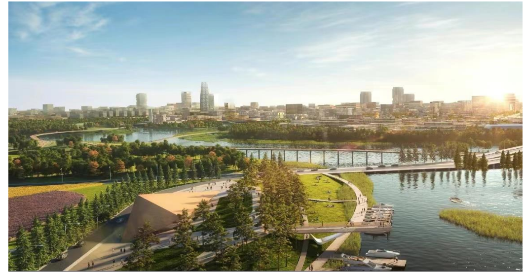
雄安生态廊道 Xiongan Ecological Corridor

As a crucial area for the coordinated development and relocation of non-capital functions from Beijing, the Xiongan New Area aims to become a high-level socialist modern city. It strives to serve as a national model for high-quality development in the new era and an innovative development demonstration zone for implementing the new development concept. The city will offer a Chinese solution to address “megacity problems” faced by metropolises worldwide. Xiongan New Area is dedicated to making the dreams of a better life for humanity come true in this city of the future.