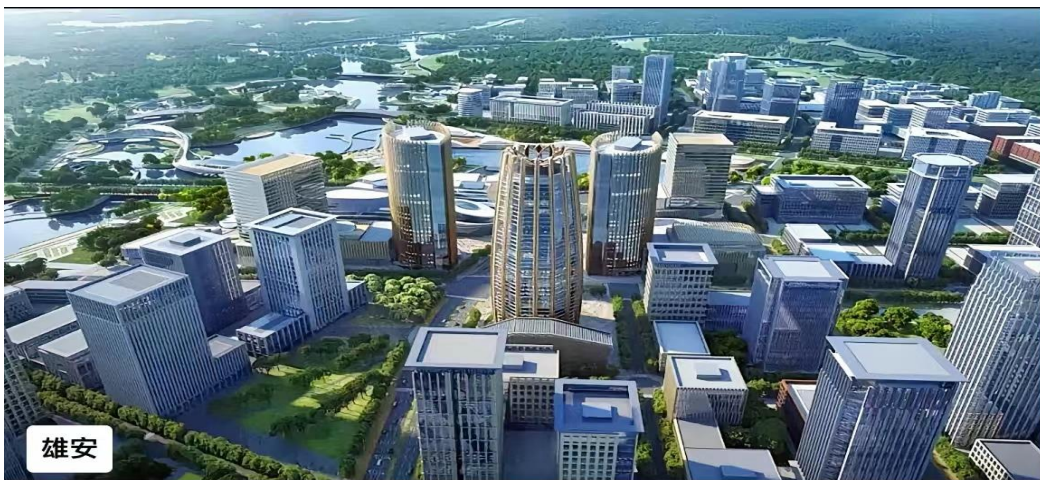
雄安国贸中心 Xiongan International Trade Center

We are committed to an open approach, strengthening cooperation and exchanges with various regions in China, actively participating in the “Belt and Road” initiative, and creating a market-oriented, rule-based, and international business environment. We are making full efforts to develop the Hebei Pilot Free Trade Zone - Xiongan Area and the comprehensive bonded zone, continuously promoting the opening up of the financial and service industries, facilitating investment and trade, and establishing new heights for expanded openness and new platforms for international cooperation. Xiongan is positioned to be a pioneer in open development.