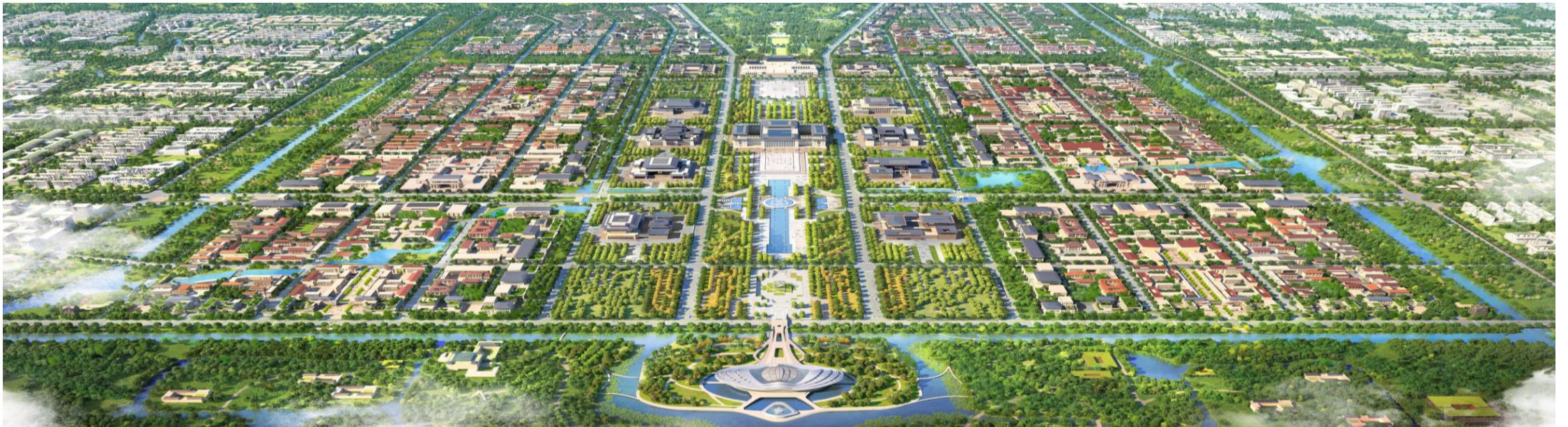
雄安中轴线和棋盘式布局 Central axis and chessboard layout of Xiongan

We adhere to the principles of “integrating the East and the West, giving priority to Chinese culture, and bridging the ancient and the modern.” We inherit excellent Chinese cultural elements such as “rectangular layout,” “central axis symmetry,” and traditional street layouts. At the same time, we incorporate world-class architectural design concepts and techniques. Our goal is to avoid the development of a concrete jungle dominated by glass facades. This approach has resulted in a unique spatial layout for Xiongan, with the pattern of “One City, Two Axes, Five Clusters, Ten Scenic Estates, a Hundred Flower Fields, a Millennial Forest, and Vast Wetland” .