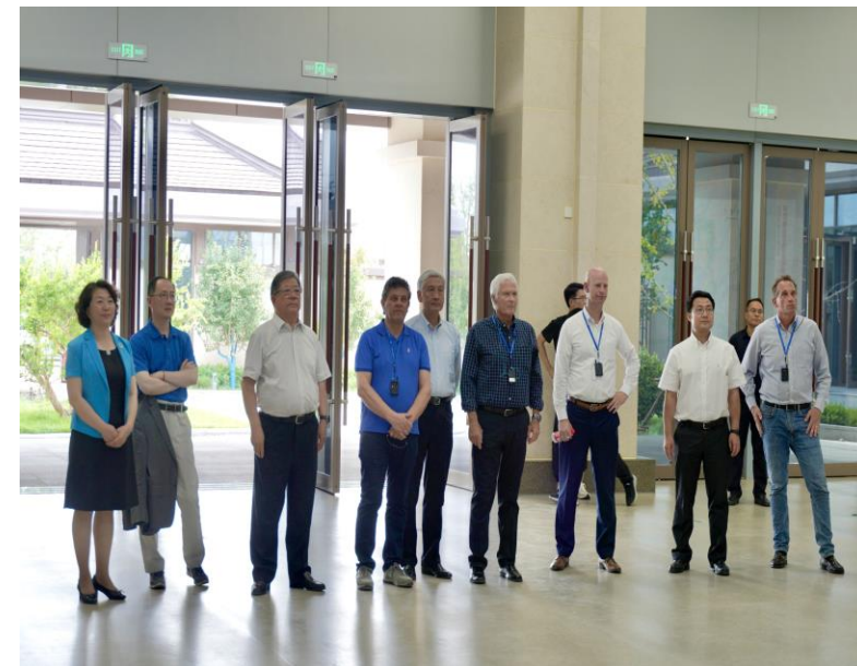
2023. 07. 02 美国艾奥瓦州代表团参访雄安 Delegation from Iowa, USA visits Xiongan

同时，也热烈欢迎各国朋友参与雄安的建设发展，让我们一起携手谱写国际交流合作、互利共赢、共建共享、共同发展的时代新篇章！