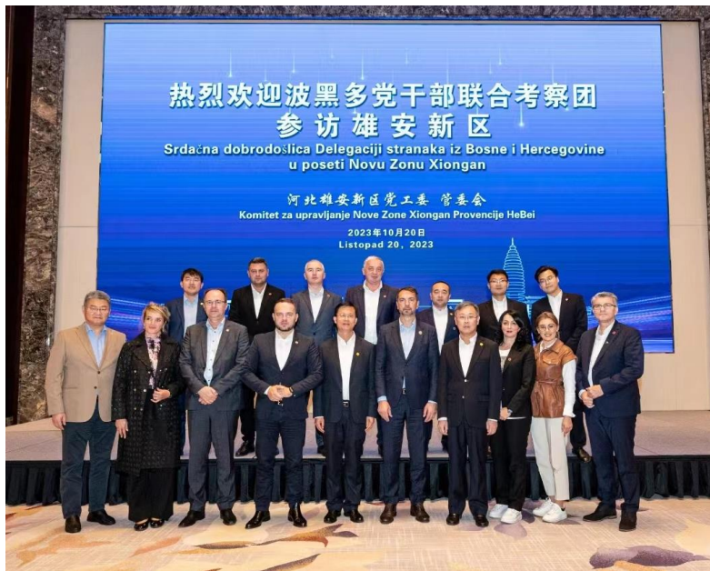
2023. 10. 20 波黑前总统查瓦拉率团参访雄安 Marinko Čavara, Former President of Bosnia and Herzegovina led a delegation to visit Xiongan