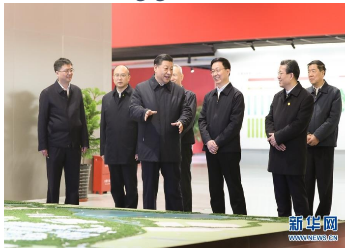
2019.01.16 习近平主席第二次视察雄安 President Xi Jinping's second inspection