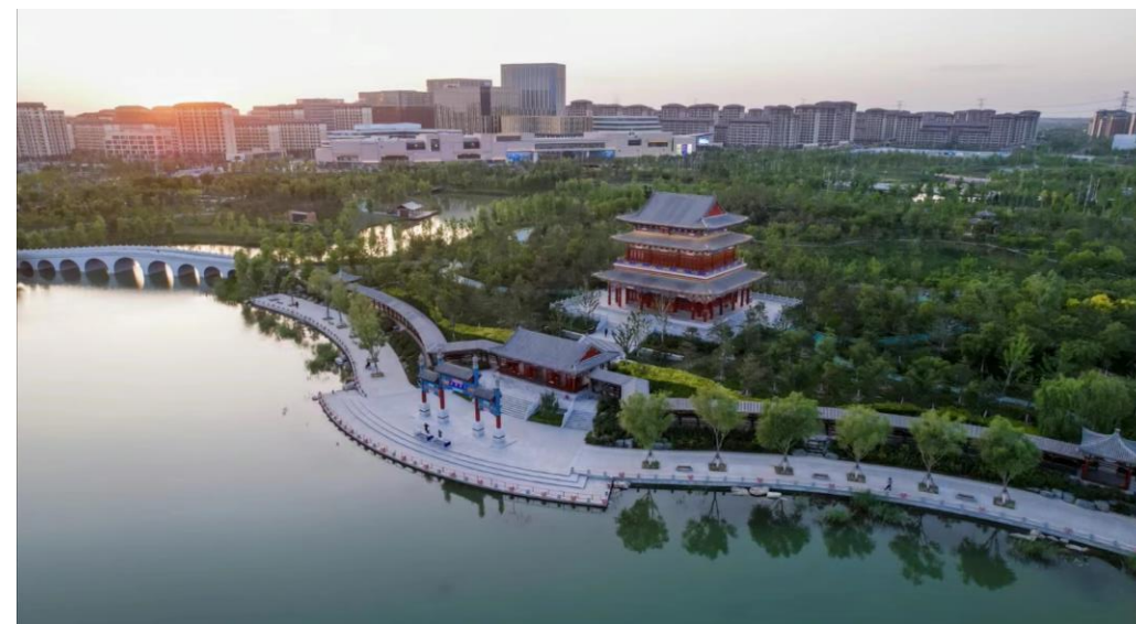
雄安金湖公园 Jinhu Lake in Xiongan

Xiongan's planning and construction have consistently adhered to the principles of “world vision, international standards, Chinese characteristics, and high-level goals”. This approach combines the promotion of Chinese traditional culture with the assimilation of the best practices from around the world. The aim is to balance cultural heritage and open innovation harmoniously.