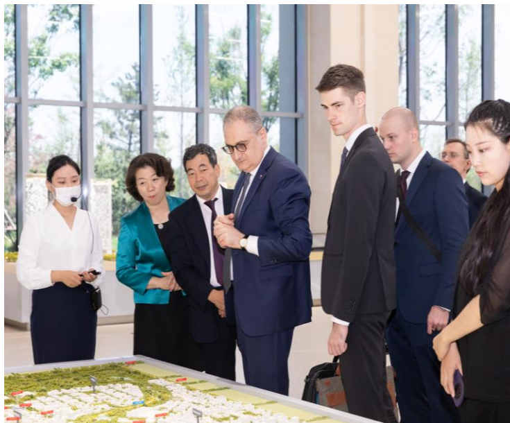
2023. 07. 04 俄罗斯代表团参访雄安 Russian delegation visits Xiongan