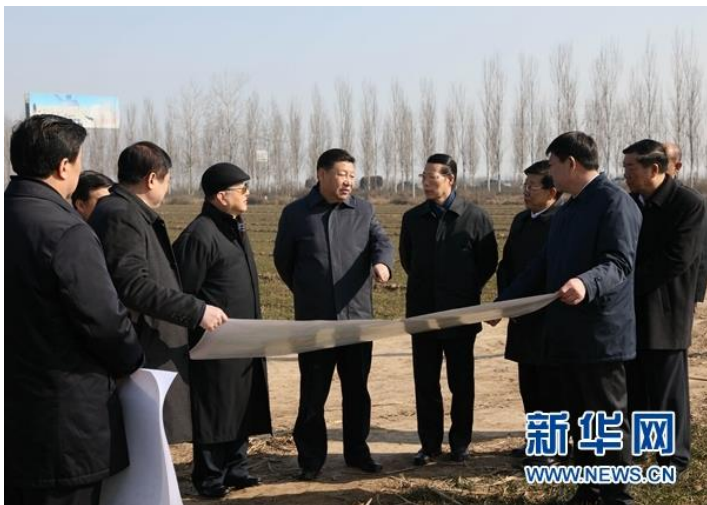
2017.02.23 习近平主席第一次视察雄安 President Xi Jinping's first inspection

Xiongan is a master plan of national significance for the next millennium . It has been planned, deployed, and promoted by President Xi Jinping in person. He has conducted on-site inspections three times over the past six years, investing great effort.