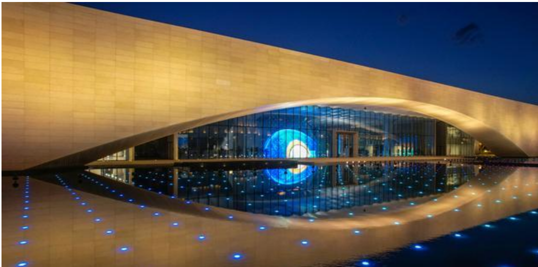
雄安城市计算中心 Xiongan Urban Computing Center

We are committed to synchronized planning of the digital city alongside the physical city, promoting the “twin city development”. We aim to build three interconnected cities: one underground, one on the surface, and one in the cloud. Our vision for an intelligent city is one where information flows seamlessly, everything is interconnected, and convenient services are a reality. Furthermore, we actively take on the responsibility of accommodating non-capital functions relocated from Beijing. We are committed to the high-level development of advanced and high-tech industries, attracting global innovation resources, and establishing several national-level innovation platforms. Our goal is to become a critical source of independent innovation and original innovation.