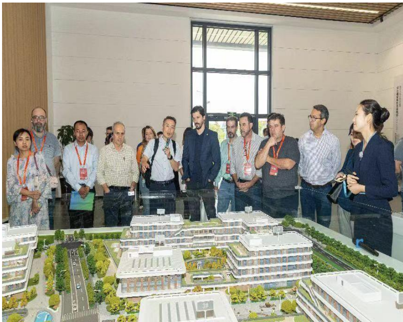
2023. 06. 18 巴西代表团参访雄安 Brazilian delegation visited Xiongan